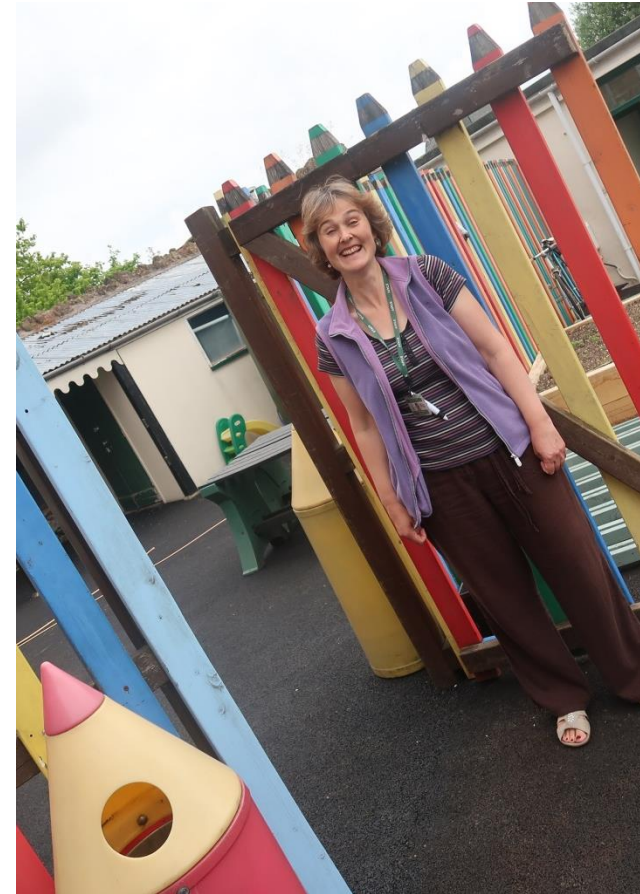
Year 1, you will say good bye at the pencil gate.