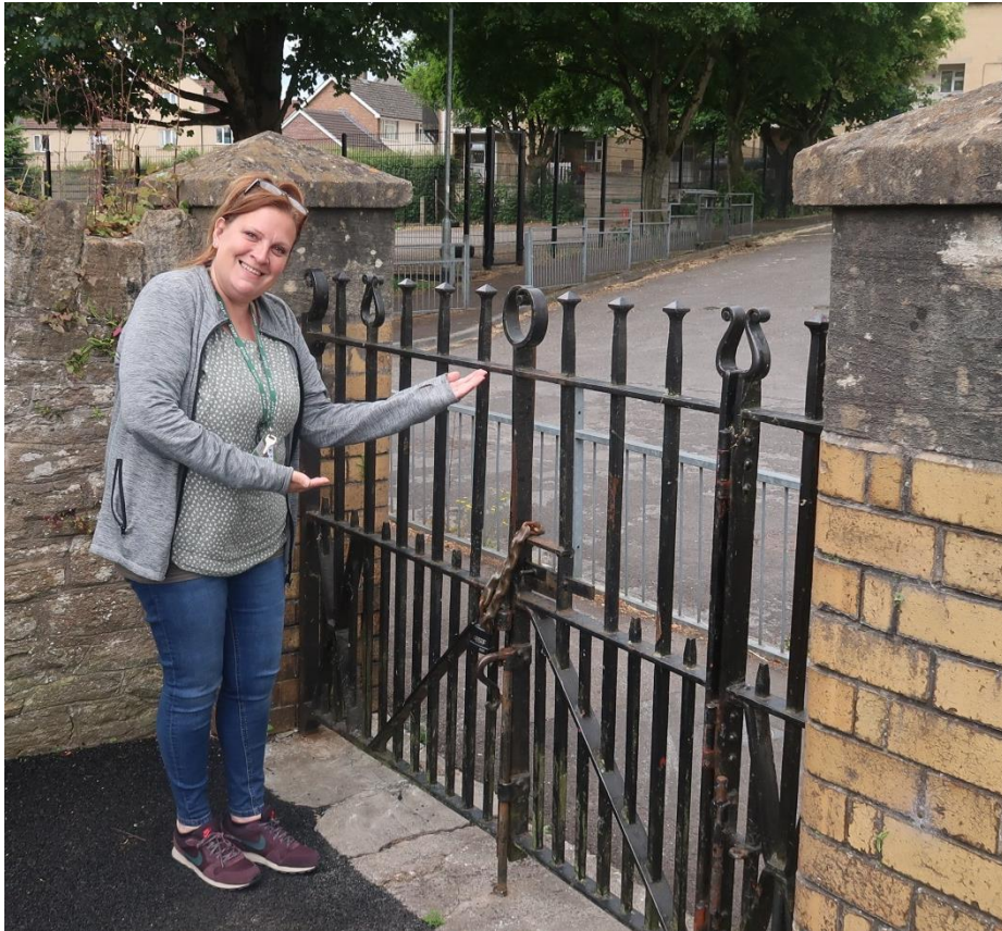
EYFS, you will say goodbye at the gate.

When you get to school you will need to say goodbye to your grown up outside. Your usual teacher will be there to help you.